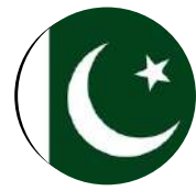
KIET- Karachi Institute of Economics and Technology, Pakistan

Altınbaş University is Now Part of the Balkan Universities Association!