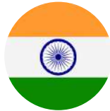
Chitkara University, India