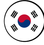
Soongsil University, South Korea