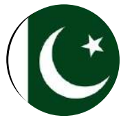
Superior University, Pakistan